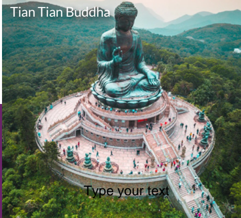
Type your text