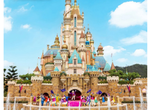
Hong Kong Disneyland