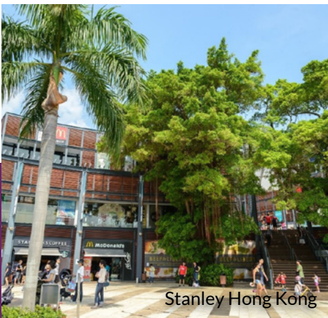
Stanley Hong Kong