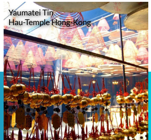
Yaumatei Tin Hau-Temple Hong-Kong