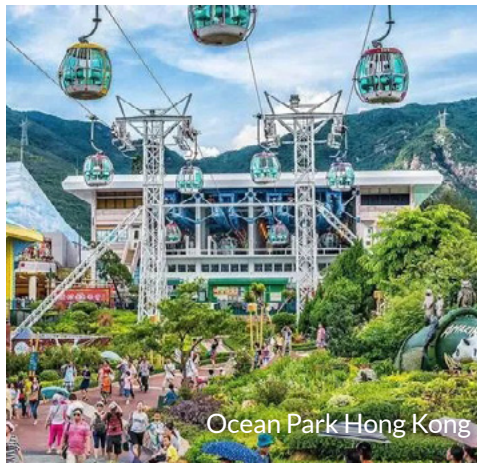
Ocean Park Hong Kong